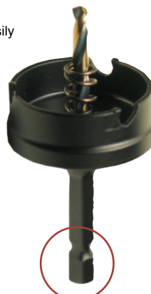
Quick Release 1/4" Hex Shank